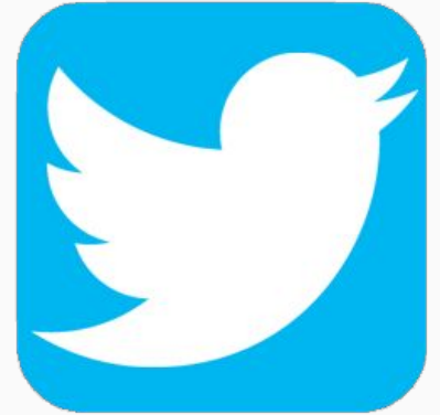
Twitter 31% of teens 14-17